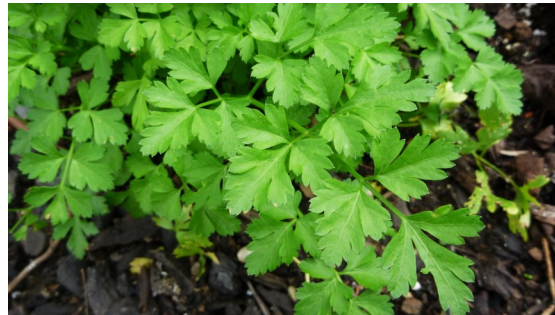
Italian Parsley ( Petroselinum crispum )