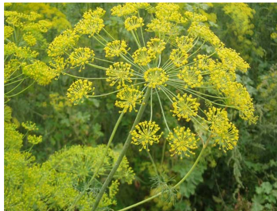
Dill ( Anethum graveolens )