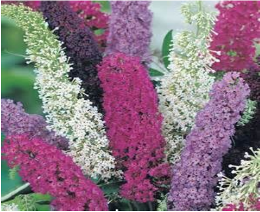
Butterfly Bush ( Buddleja )