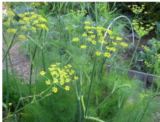
Fennel ( Foeniculum vulgare )